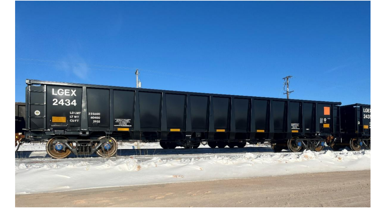
New gondola railcar that was built in 2024.